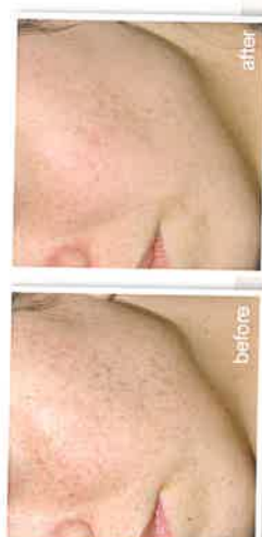
Age/sun spot and photorejuvenation treatment