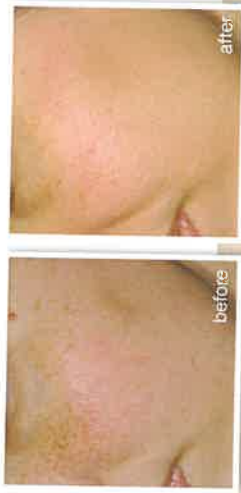
Figmentation and freckles treatment