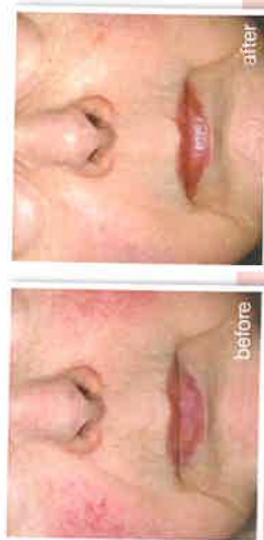
Rosacea and photorejuvenation treatment photo courtesy of Giv. Moravkai, M.D.