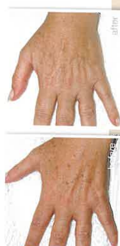
Age/sun spot treatment